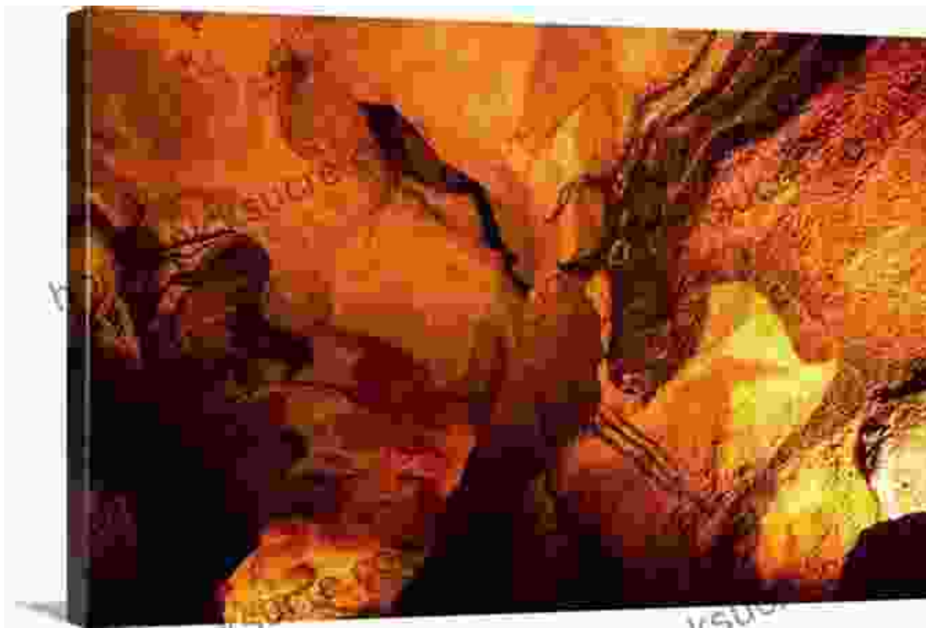
Engraved art on the walls of the Font-de-Gaume cave in France

Gaume's walls are adorned with detailed engravings of animals, humans, and geometric symbols. These engravings were created using sharp stone tools and depict a wide range of subjects, from bison and reindeer to mammoths and human figures.