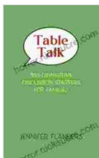
Table Talk: 365 Dinnertime Discussion Starters for Families

Start using Table Talk 365 today and see how it can improve your family dinners and strengthen your relationships.