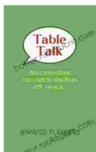
Table Talk: 365 Dinnertime Discussion Starters for Families

Looking for ways to make family dinners more engaging and meaningful? Check out Table Talk 365, a collection of 365 thought-provoking discussion starters to get your family talking and connecting.